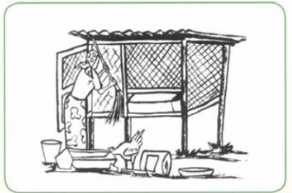
Raised slatted house

This house is raised half a meter from the ground to ensure dropping fall through. Slats are made from stick or hard wire, Allow 10 birds per meter squared in the house.